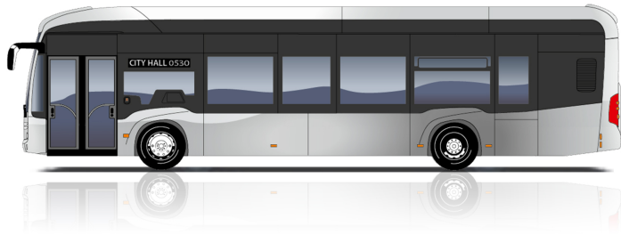
eCitaro 1 door

Length [mm]: 12,135 Turning circle [mm]: 21,214