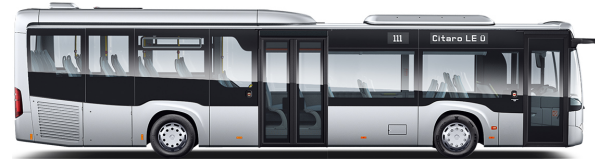
Citaro LE Ü

Length [mm]: 12.170 Height [mm]: 3.315 Turning circle [mm]: 21.568 Width [mm]: 2.550