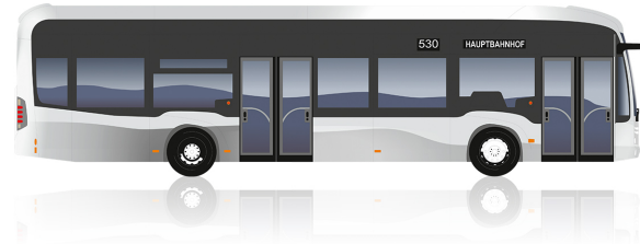
eCitaro 2 doors

Length [mm]: 12.135 Turning circle [mm]: 21.214 Height [mm]: 3.400 Width [mm]: 2.550