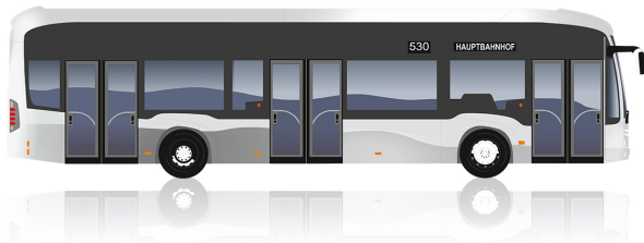
eCitaro 3 doors

Length [mm]: 12.135 Turning circle [mm]: 21.214 Height [mm]: 3.400 Width [mm]: 2.550